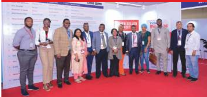
16 Delegates from Tanzania, Mali, Mozambique, Benin, Ivory Coast, Burkina and Faso.