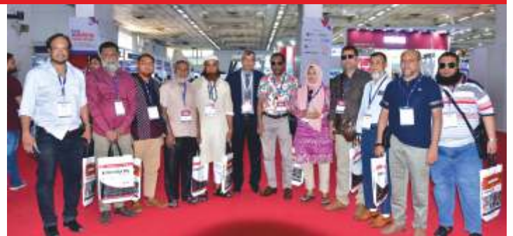
22 Delegates from Bangladesh