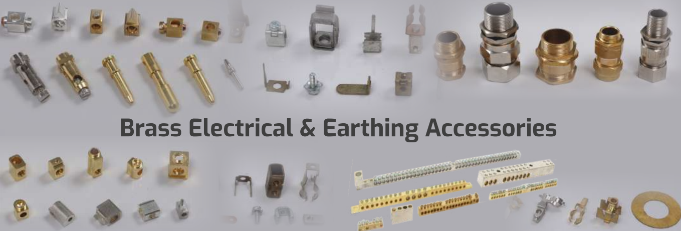
Brass Electrical & Earthing Accessories