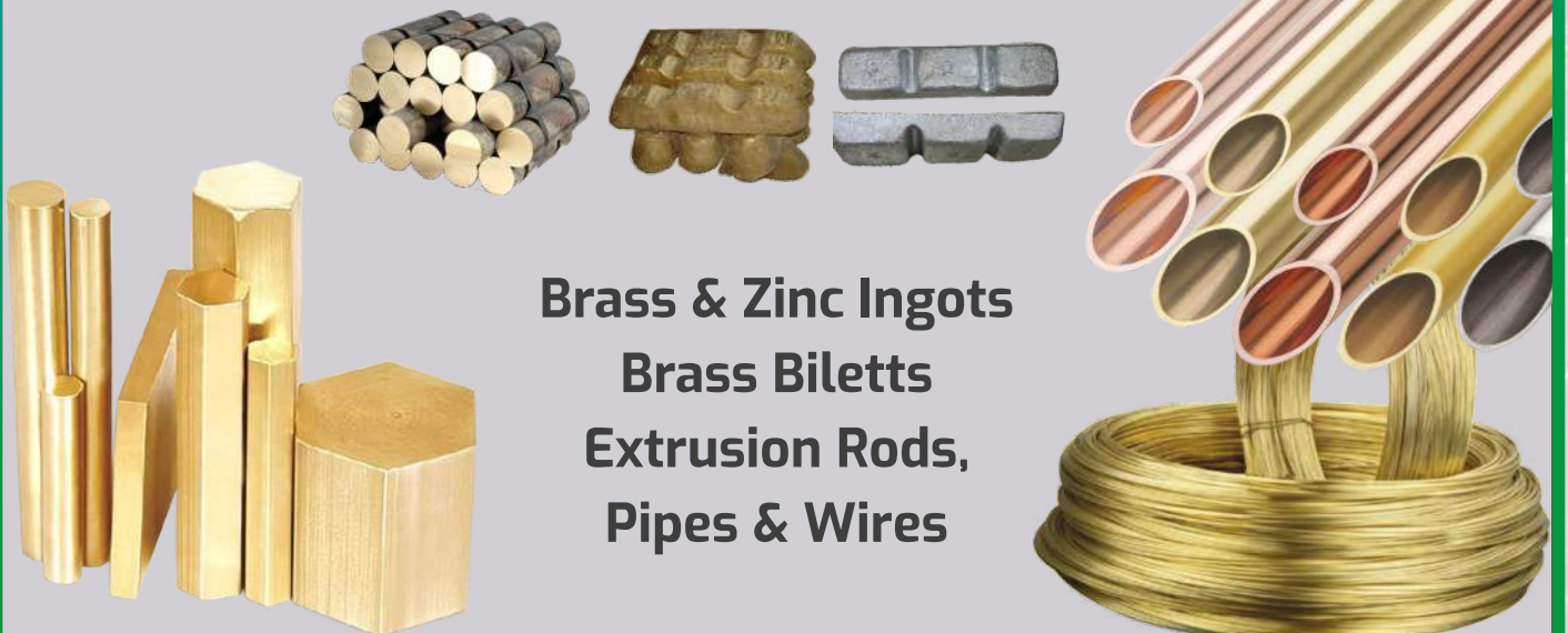
Brass & Zinc Ingots Brass Billets Extrusion Rods, Pipes & Wires