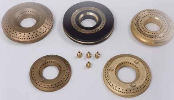
Brass Gas Parts