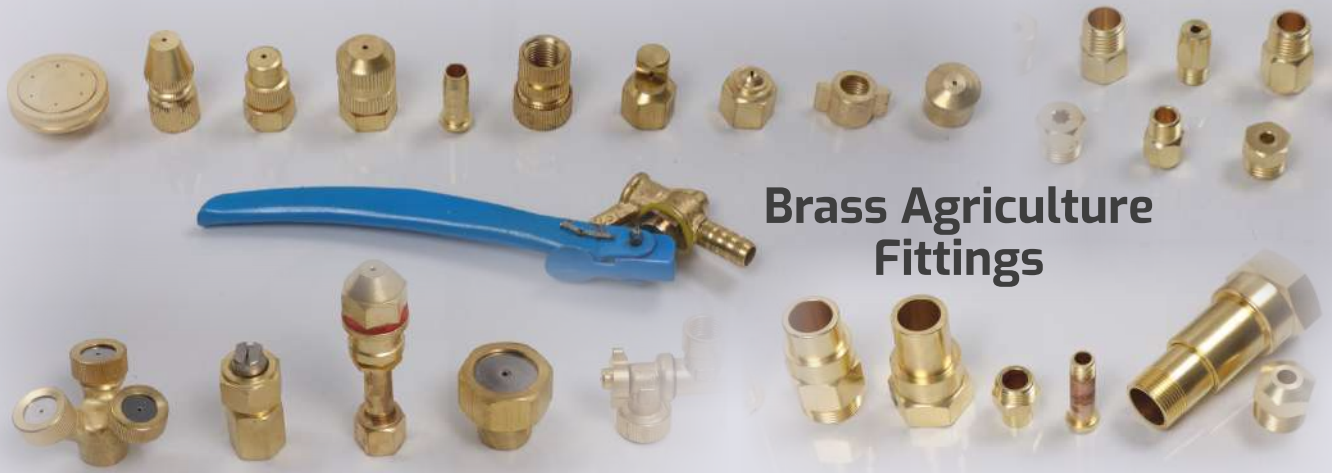
Brass Agriculture Fittings