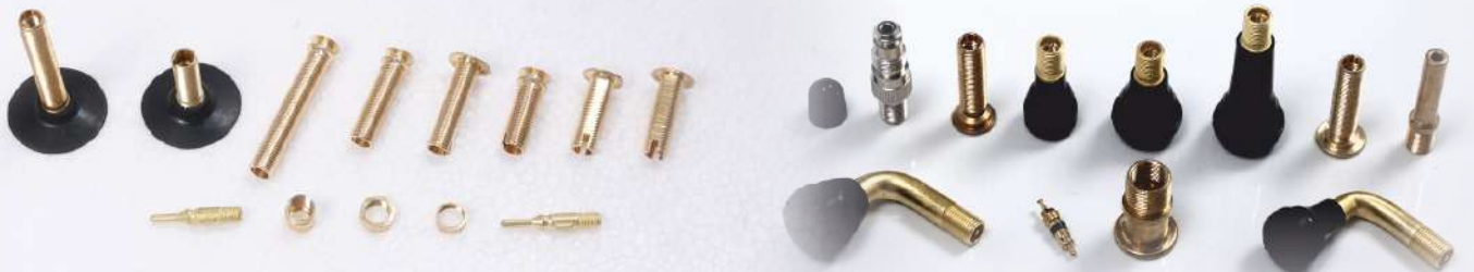
Brass Bicycle & Auto Tube Parts